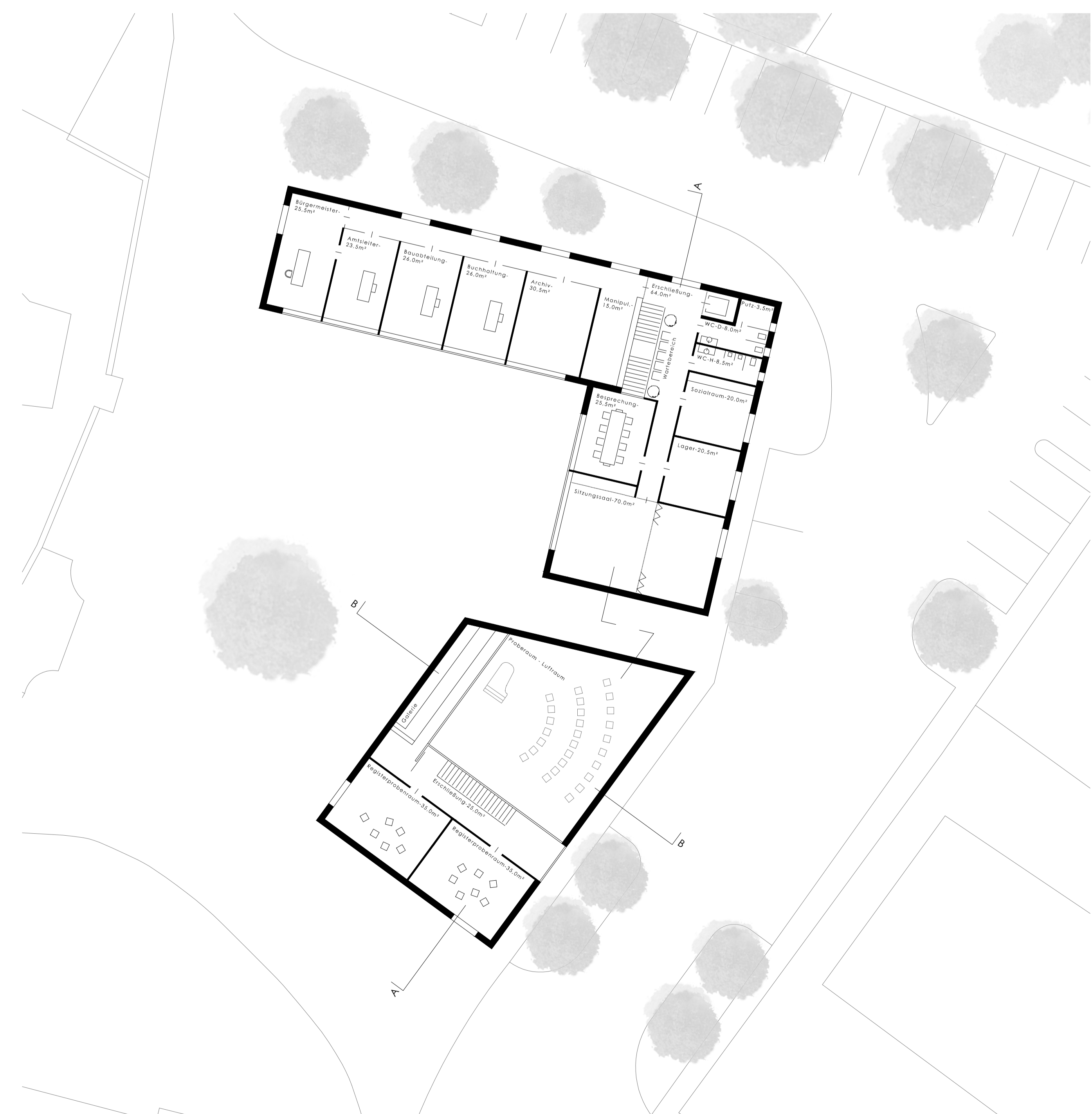
grundriss obergeschoss | m1:200