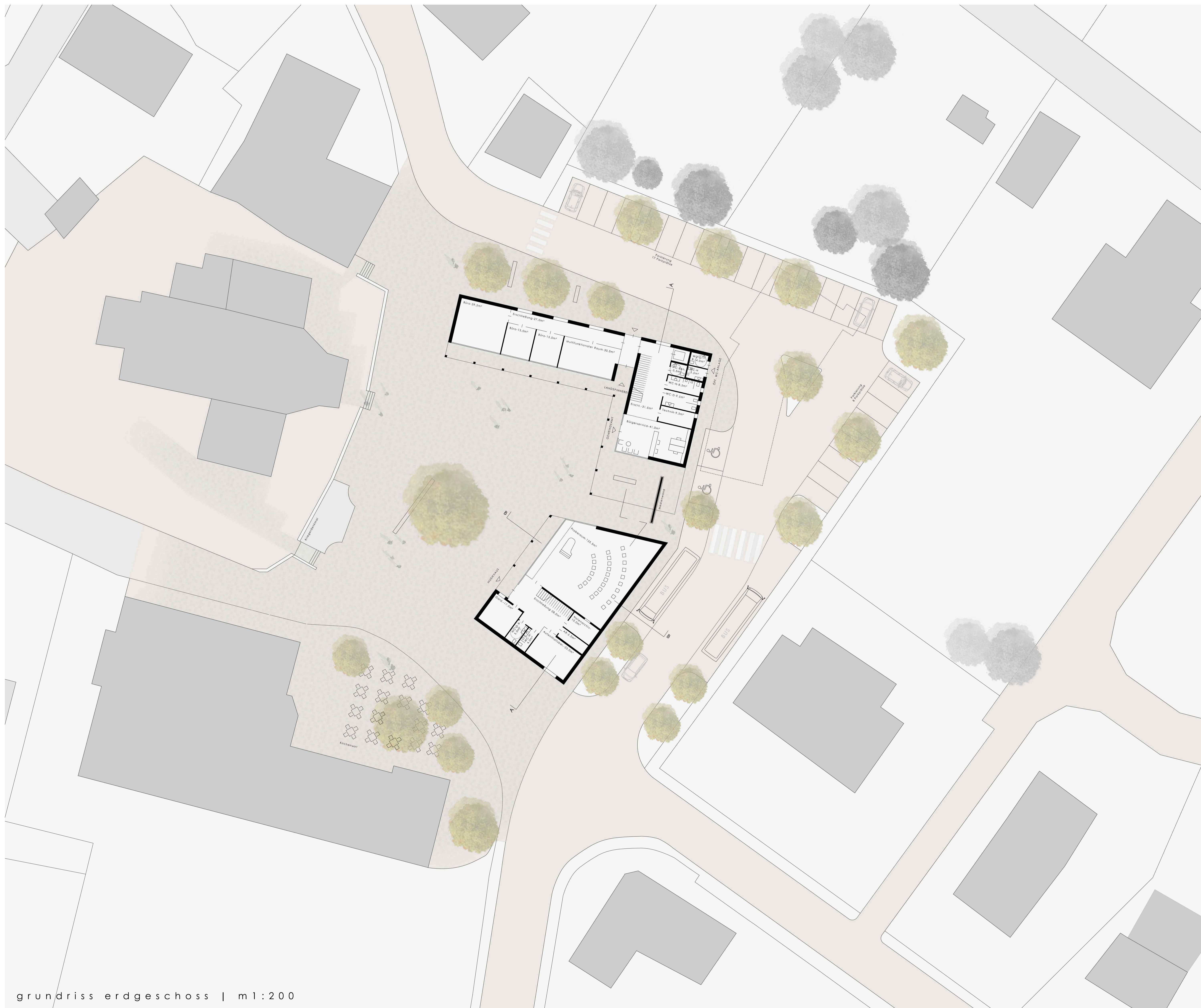
grundriss erdgeschoss | m1:200